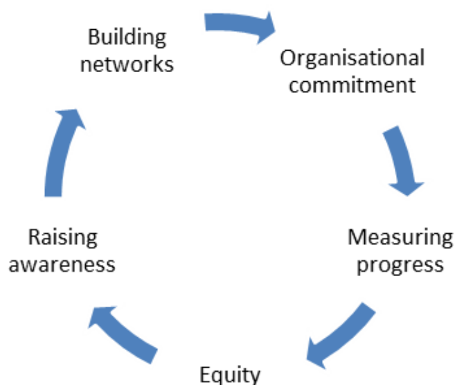
Figure 4: Actions for ensuring successful sustainability programmes

A number of actions need to be taken to create a solid foundation on which a sustainability programme can progress and succeed. Figure 4 summarises these actions, while the discussion that follows provides further information and links to other relevant resources.