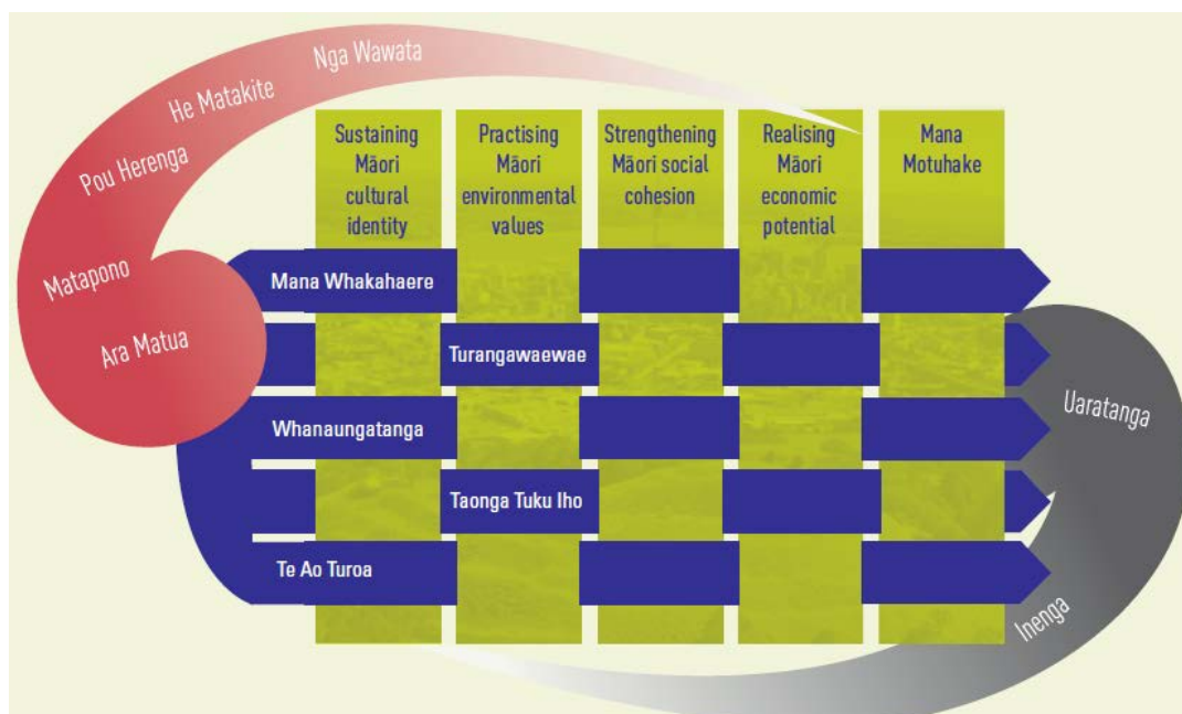
Figure 2: Te Kōhau o Te Ngira – a mana whenua sustainability framework

An example of how Māori perspectives are being incorporated into sustainability initiatives comes from Te Kōhau o Te Ngira, a mana whenua sustainability framework, which mana whenua iwi and hapū groups in the Auckland region have developed as part of the Auckland Sustainability Framework is given in Figure 2.