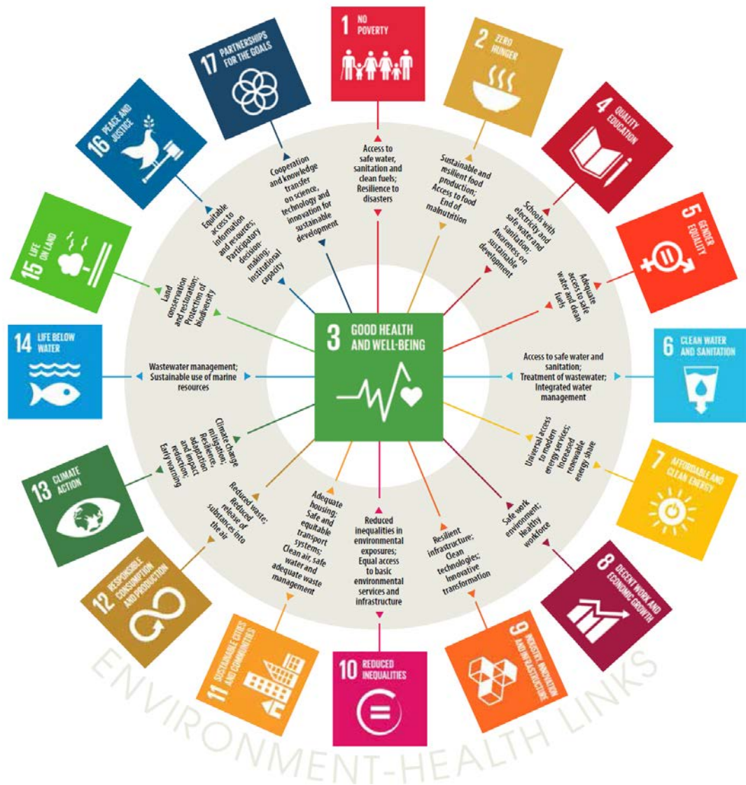
Figure 1: Sustainable development goals and environment-health risks